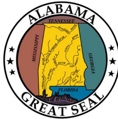
Alabama Department of Conservation & Natural Resources

Funding for this project is provided by the Alabama Department of Conservation and Natural Resources, State Lands Division, Coastal Section, in part, by a grant from the National Oceanic and Atmospheric Administration, Office of Ocean and Coastal Resource Management, Award # NA07NOS4190175